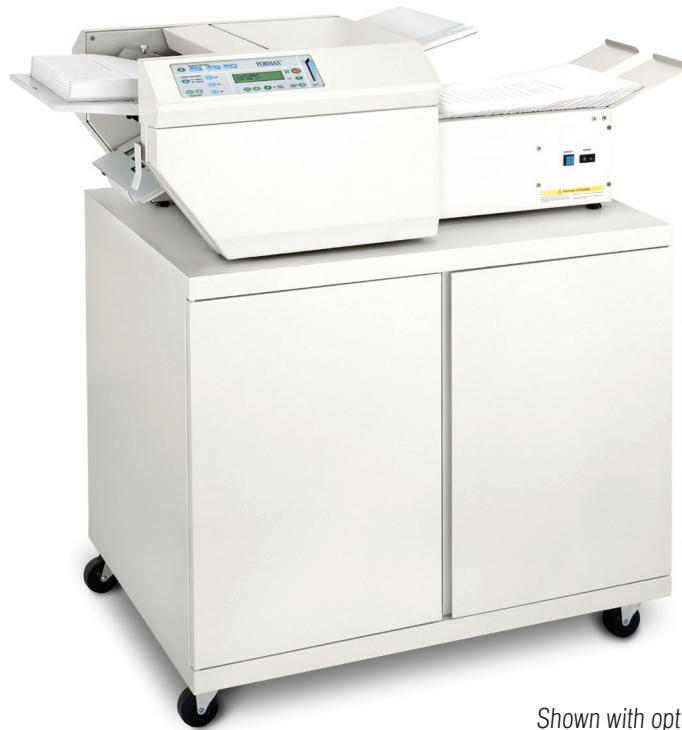
Shown with optional cabinet and 18" conveyor

The AutoSeal ® FD 2052 is a fully automatic pressure sealer which provides the ultimate solution for processing pressure sensitive self-mailers. Designed with ease of operation and efficiency in mind, the FD 2052 automatically detects and adjusts for 11" and 14" (Int'l Size A4) paper sizes and is pre-programmed for three popular folds: Z, C and Half folds. The FD 2052 also has the ability to store up to nine custom fold settings with the simple touch of a button.