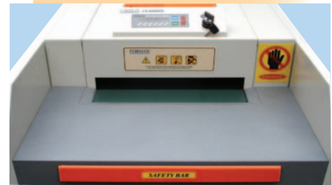
Large infeed deck with conveyor belt feeder and safety bar for immediate shut down