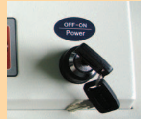
Keyed "On/Off" switch