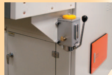
Optional EvenFlow™ Oiling System reservoir and pump