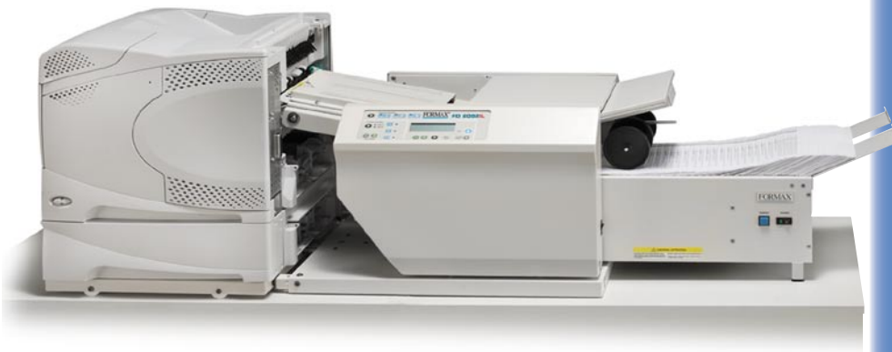
FD 2052IL System shown with IL Pressure Sealer and IL Alignment Base, laser printer (not included), optional conveyor and optional locking cabinets