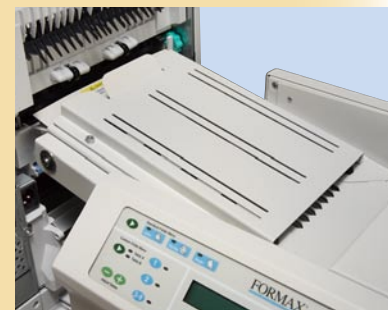
Enclosed paper path provides optimal document security